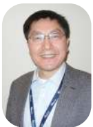
Lei Bao NCS Testing

The SSC is also comprised of a Supplier Support Committee Leadership Team (SSC LT) which reviews and addresses non-technical concerns raised by Suppliers. The SSC LT members include: